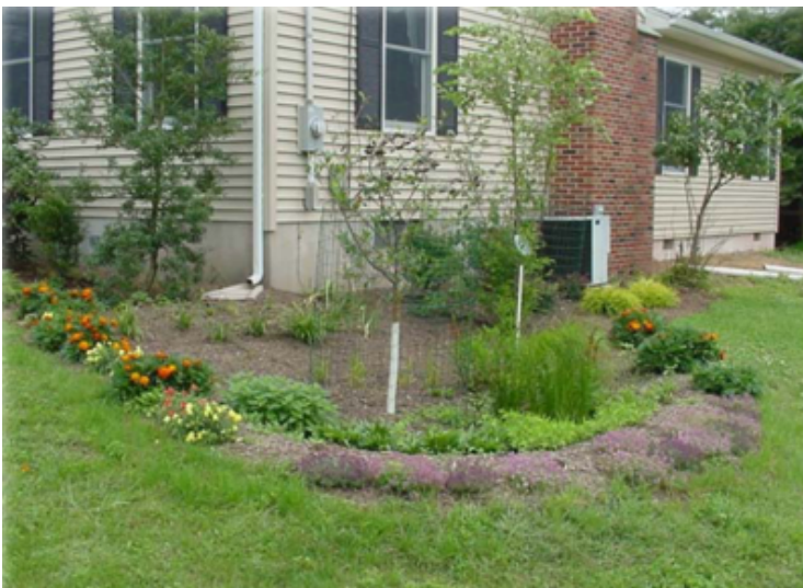
Home Rain Garden Example

Rain gardens are a beautiful and colorful way for homeowners, schools, businesses and municipalities to help ease storm water issues.